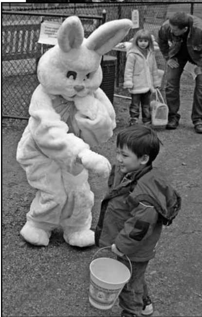
The bunny helps the hunter.