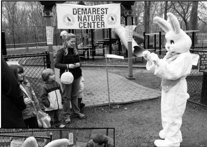
The bunny greets her fans.