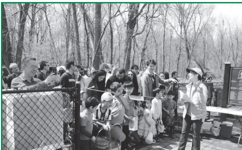
The Easter Egg Hunt with the Easter Bunny drew a large crowd. Children enjoyed some yummy fun