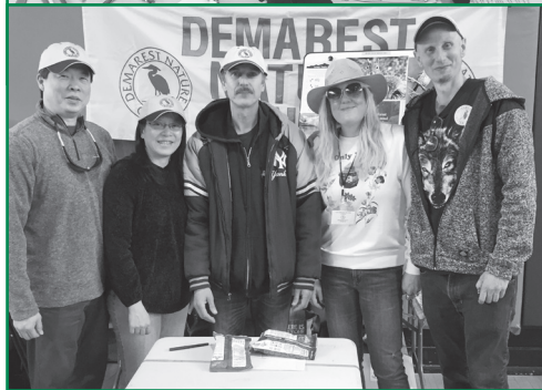
Northern Valley Earth Fair The children had lots of fun touching the skunk cabbage and mushrooms that were picked from the Demarest Nature Center. They were also very busy coloring educational wildlife sheets.