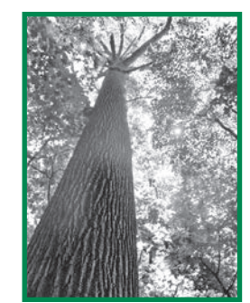
"Tallest Tree in Demarest" Max Goldstein