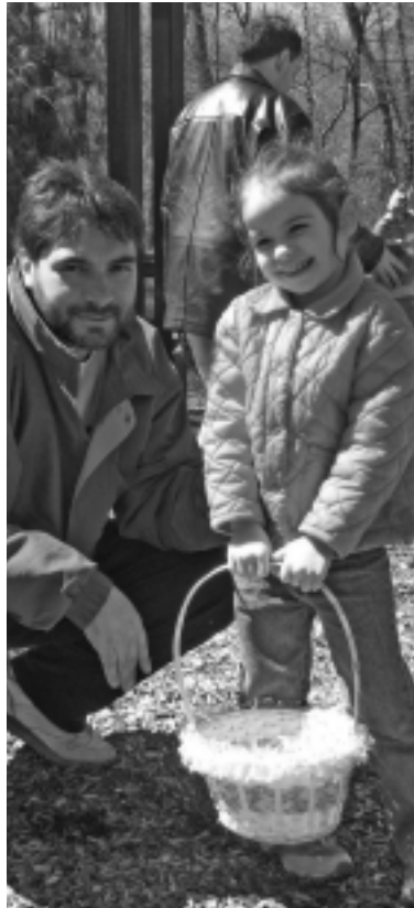
Above, smiles at the Easter egg hunt.