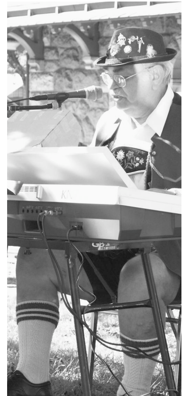
Above, German music lends an authentic air to Oktoberfest. Below, Tenakill Brook and the steel bridge are robed in snow in February 2006.