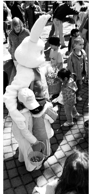
Above: The Easter Bunny didn't disappoint on it's visit to the Wakelee Playground this Spring