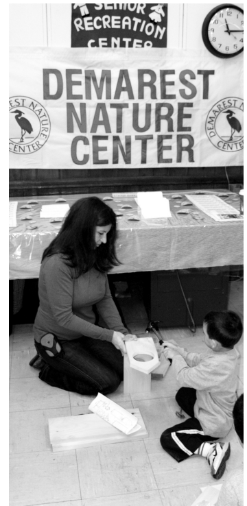
Below: Another successful birdhouse & feeder building day