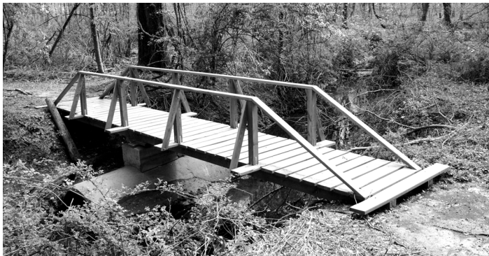
The Trestle Bridge!

immediately turn left onto the Stelfox Trail, and go about 50 yards. The entrance to the trail is on your left. The trail meanders for about half a mile before reconnecting with the Stelfox Trail a bit farther south.