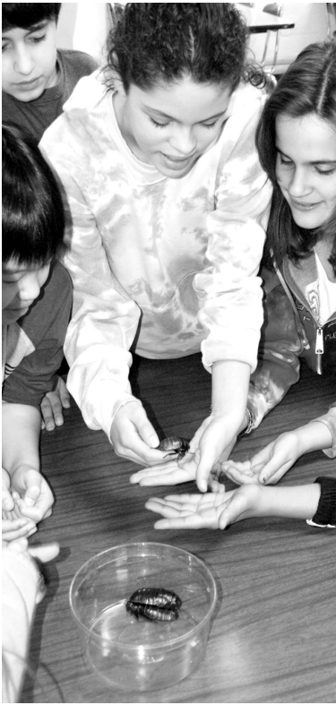
(Above) Sixth and seventh graders at Demarest Middle School learn about Rainforest animals and insects.

Thank you for supporting The Demarest Nature Center and nature education in 2007.