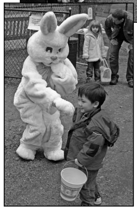
The bunny helps the hunter.