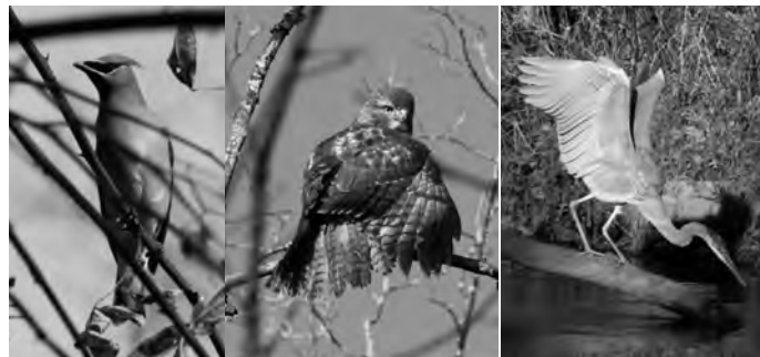
From Left to right: Cedar Waxwing, Red-tailed Hawk, and the DNC mascot Blue Heron.